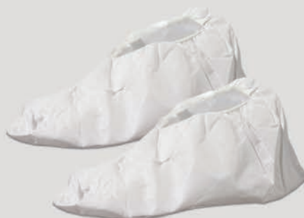
AQUATRAK® SHOE COVERS