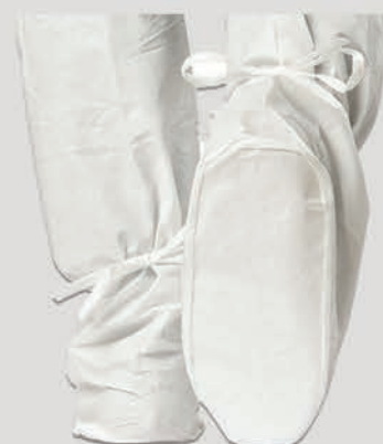
MAXGRIP® BOOT COVERS

FOR MORE INFORMATION VISIT THOMASSCI.COM