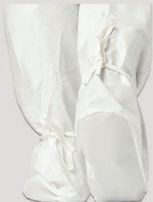
ULTRAGRIP™ BOOT COVERS