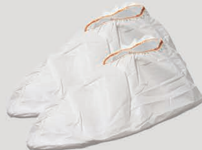
MAXGRIP® SHOE COVERS