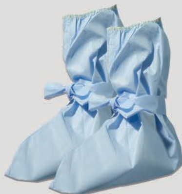
AQUATRAK® BOOT COVERS