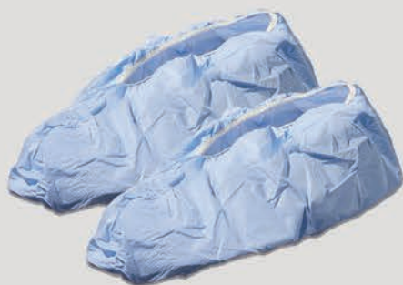
SUREGRIP® SHOE COVERS

SUPERIOR QUALITY, PERFORMANCE AND DURABILITY