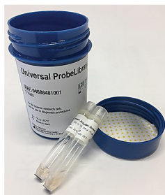
Probes and Primers