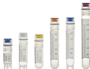
Cryovials and Tubes