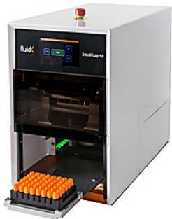
Cappers and Decappers

Minimize your risks with a custom cold storage solution crafted by Thomas Scientific's team of experts. From scanners to storage boxes to autoclaves, we can help you find the right products and even properly configure your physical storage to optimize workflow and prevent accidents.