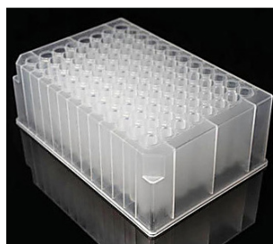
Deep Well Plates

Interested in adopting an extraction-free workflow? Contact your rep to find out how.