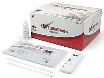
Rapid COVID-19 Tests

Our expansive offering of thermal cyclers, plate readers, and other associated products will allow you to isolate and accurately identify multiple types of pathogens or conditions with the utmost confidence. We have partnerships with top global suppliers including Tecan, Analytik Jena, and many more.