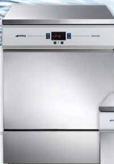
Thomas No. 1183J35 GW0160 Laboratory Washer

Choose from 1 Year Extended Warranty OR $700 Credit towards accessories!