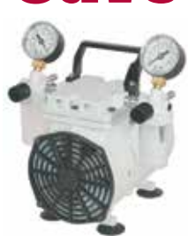
Dry Vacuum Pumps