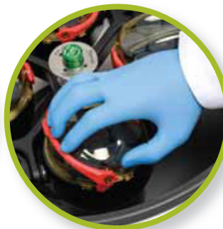
ClickSeal™ biocontainment lids