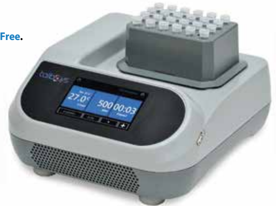
*Supplied with clear rack and cover

Please visit: thomasci.com/deals for redemption form. Offer expires 9-30-2016.