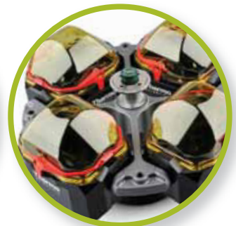
4-liter capacity TX-1000 rotor