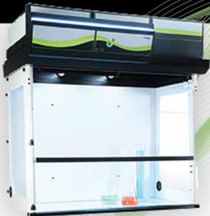
Captair Smart 483 Ductless Fume Hood

The most advanced molecular filtration technology available.