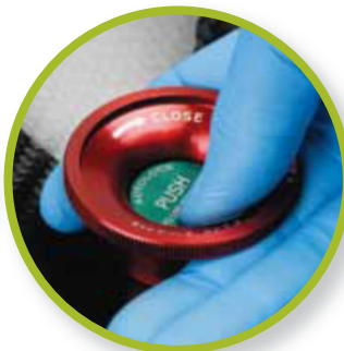
Auto-Lock™ rotor exchange