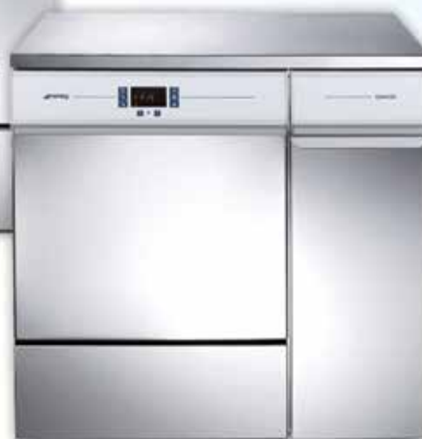
Thomas No. 1183J45 GW4190 Laboratory Washer with Dryer

Please visit thomassci.com/deals for more information and redemption form. Offer expires December 31, 2016.